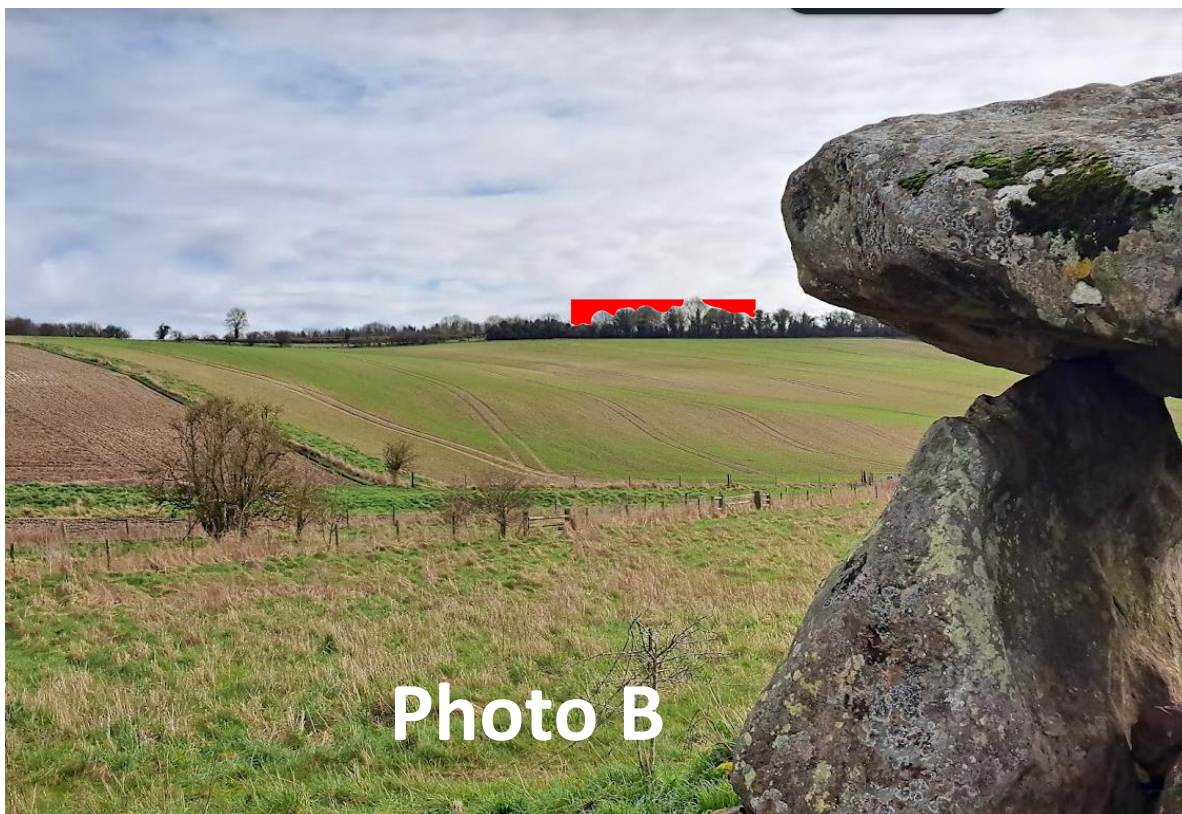
Figure 4 Photo taken from Devil's Den looking towards grain store