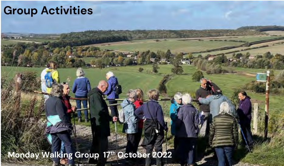
Monday Walking Group 17 th October 2022