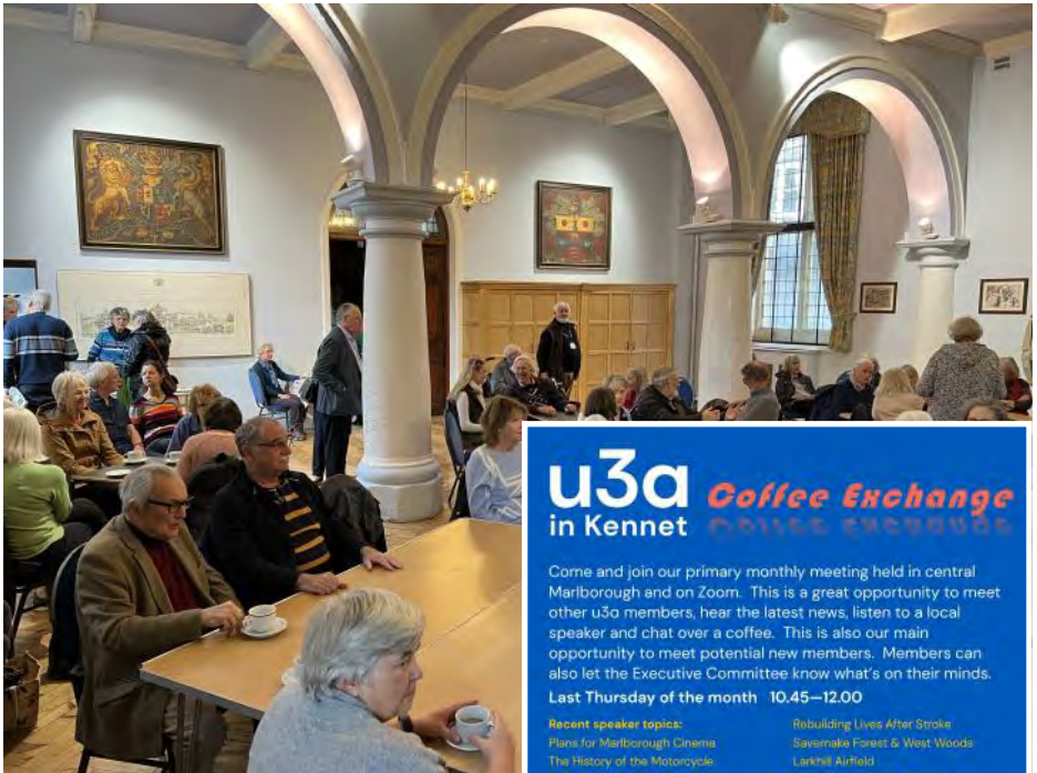
2 nd November 2022 Town Hall