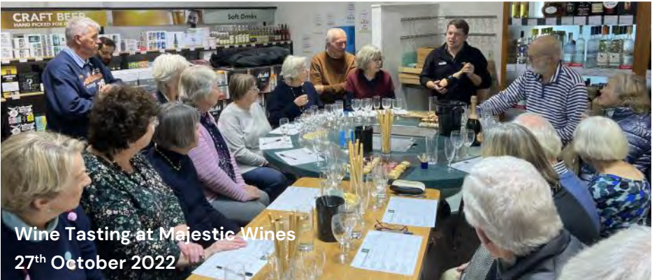
Wine Tasting at Majestic Wines 27 th October 2022