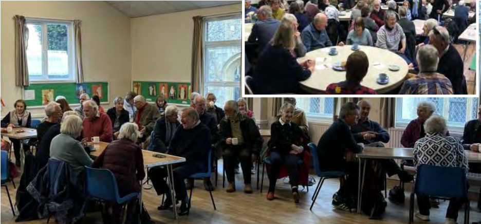
29 th September 2022 St Marys Hall