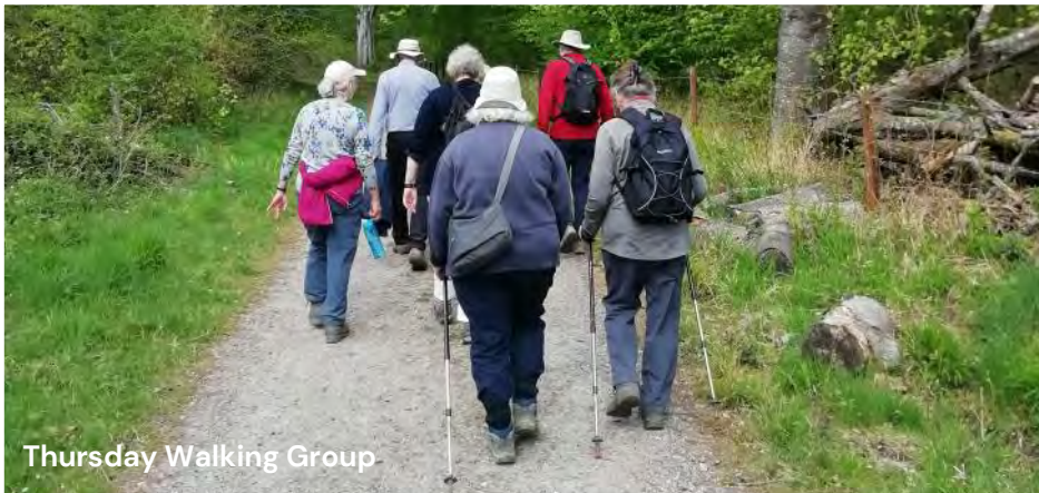
Thursday Walking Group